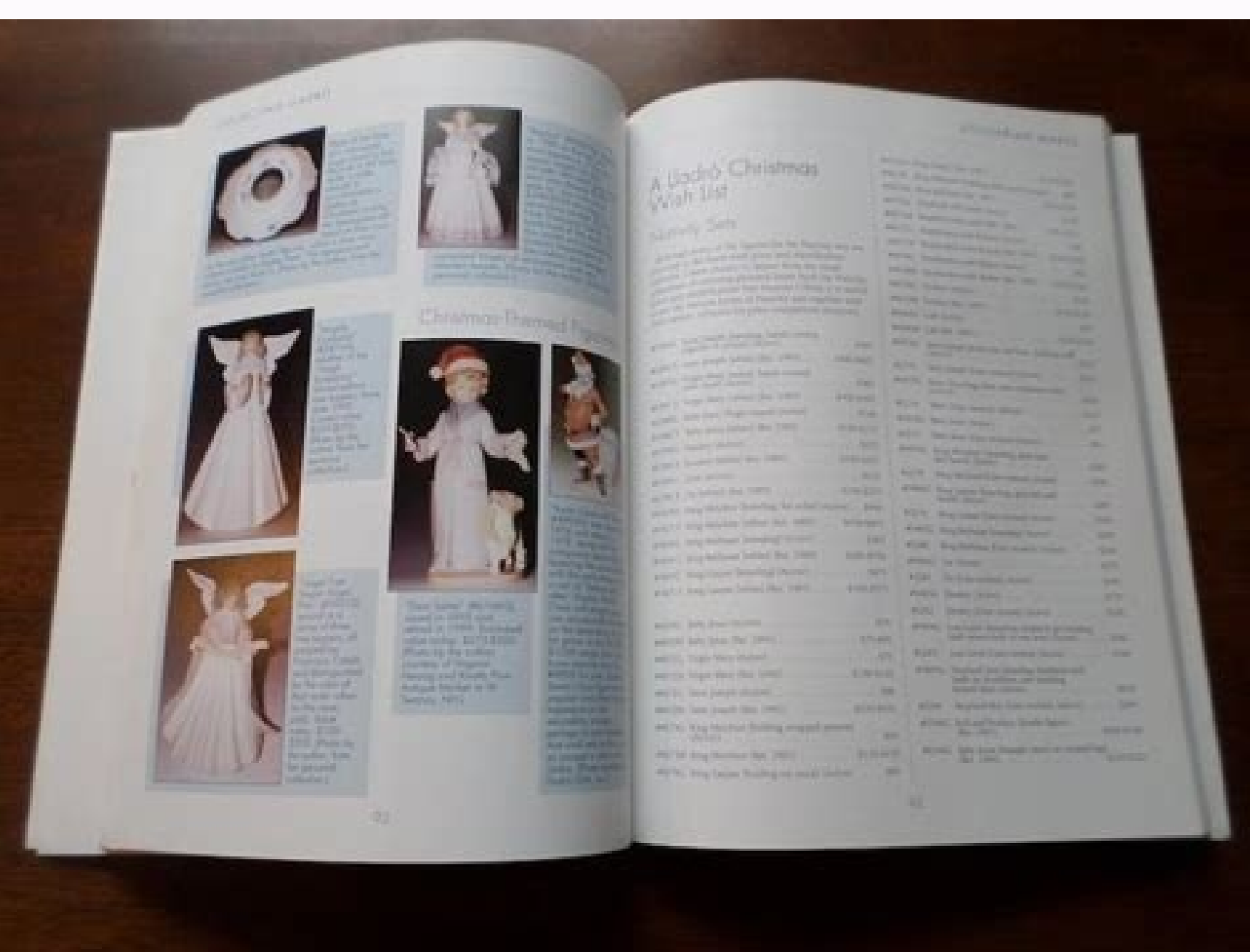
Are all lladro figurines marked. How do i identify my lladro. Collecting lladro identification & price guide.